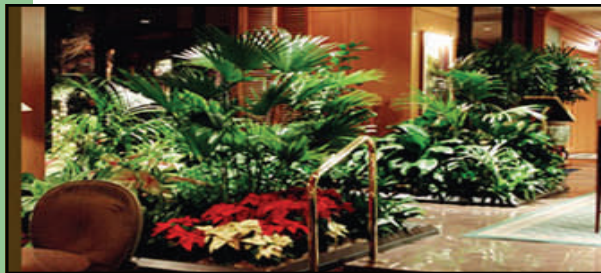
The owner of "A Growing Business" developed the first Interior Design course offered in the Wisconsin Technical College system in 1986.